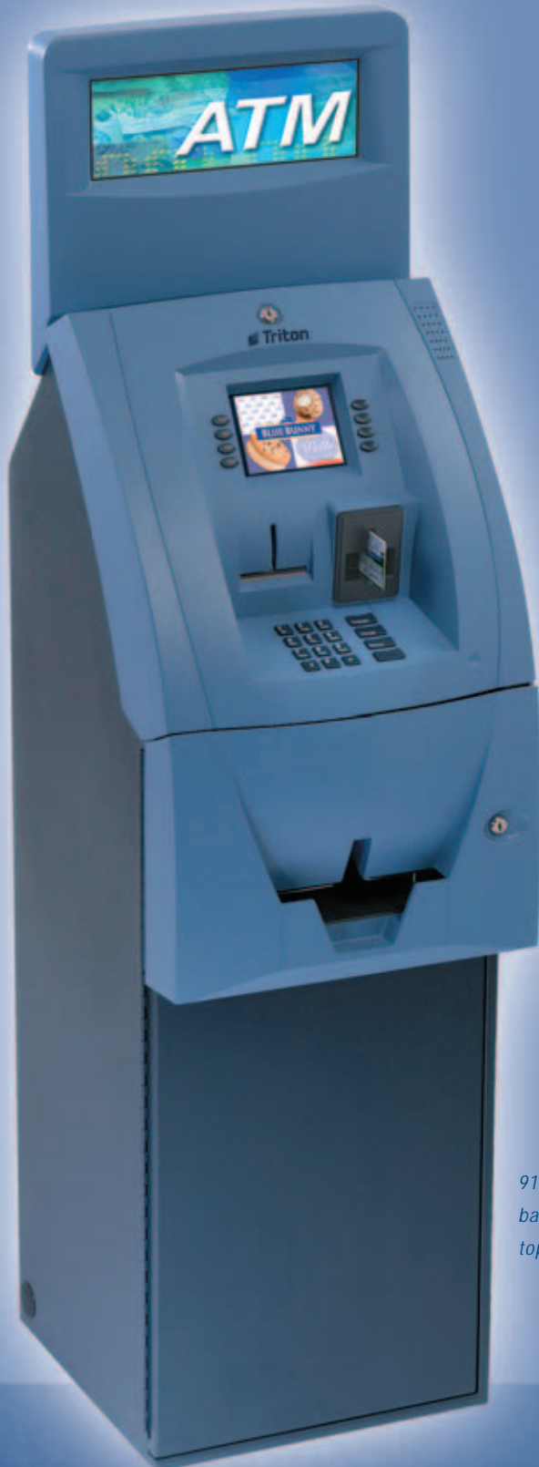
9100 with backlit topper

In the mid 90's, Triton took the ATM industry by storm with the release of its 9500 model ATM. It was the first low-end, off premise ATM the marketplace had seen and it quickly became an icon.