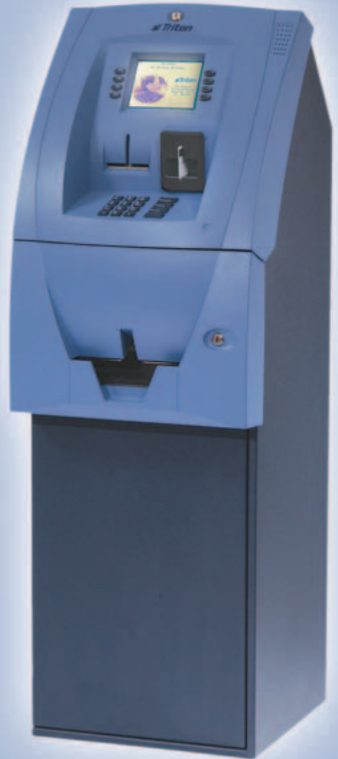
9100 without topper